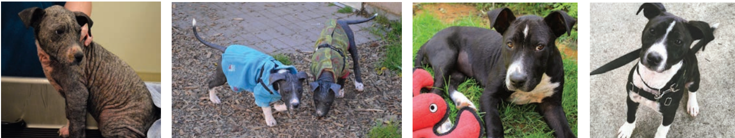
Stray pups Molly and Polly arrived at SHS suffering from severe Demodex (mange). In a foster home they received the weekly medicated baths they needed to recover from their skin infections, as well as lots of socialization to ensure they would grow up to be happy, well-adjusted dogs.

On the outside they may look like mere mortals, but on the inside they possess the gumption, fortitude and compassion that saves lives. Our foster volunteers are a very big deal to us and to the animals in our care. These are the superheroes making a direct impact in the lives of homeless animals—and they’re an important reason we are able to operate as a no-kill shelter. By placing select animals in temporary foster homes, we are not only able to physically and emotionally rehabilitate animals who are not yet ready for adoption, we can also extend our capacity to care for animals who might otherwise be facing euthanasia in other shelters.