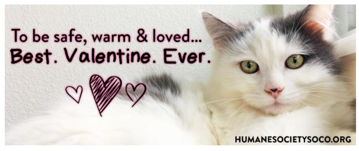
A Safe Haven for Animals

In this issue: Events | Pet o' the Month | Happy Tails | Kibbles & Bits