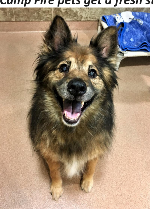
Thanks to you, Chance got a chance!

Just a year after wildfires devastated Sonoma County, Butte County suffered wildfires of their own, resulting in the loss of homes for people and animals alike. Last month, Northwest SPCA (NSPCA) in Oroville was filled to the brim with stray pets like Chance ( left ), and Basil ( the green-eyed beauty above ) who, sadly, were never claimed or had to be surrendered after the Camp Fire. Faced with some hard decisions due to lack of space, they reached out to the Humane Society of Sonoma County and our friends at North Bay Animal Services (NBAS) in