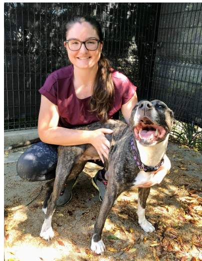
Sweet Cakes - Senior Love