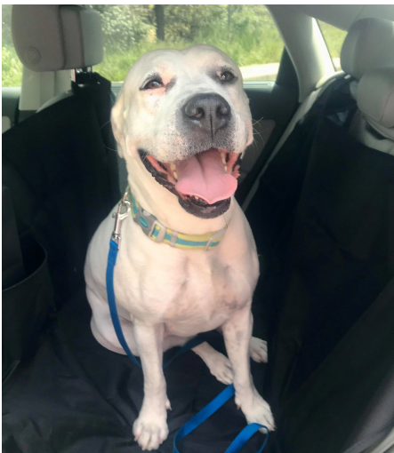
Heidi - Best Friend