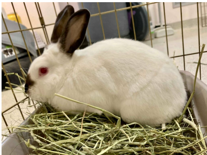
Dusty, sweet and sensitive.

With their sweet fluffy softness, their amusing binkies*, their endlessly interesting personalities... sigh, we admit it – we LOVE bunnies! If you've been thinking about bringing a rabbit into your family, now is the perfect time!