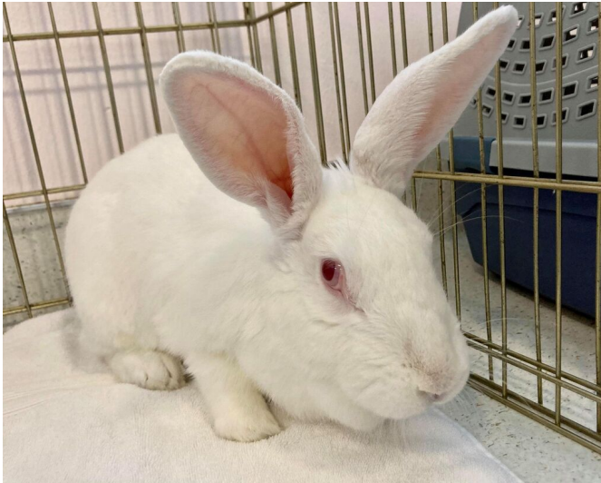
Lilly, big and gentle.

infected rabbits, the virus can be spread by fleas, flies, insects and mosquitoes, as well as by birds, rodents and other animals.