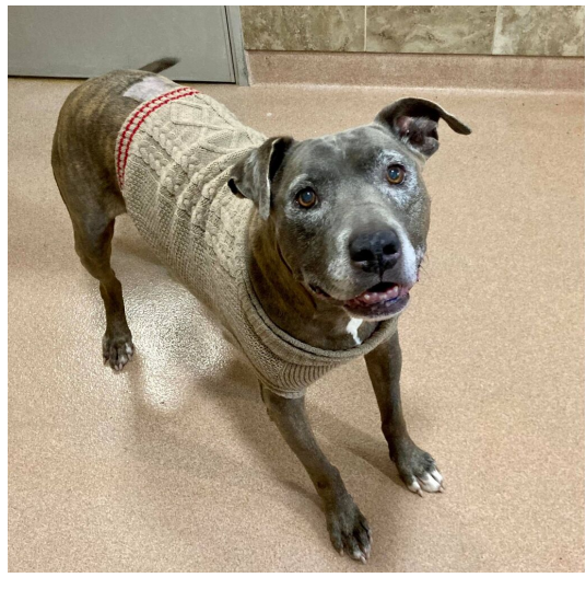
Asher 7 years old