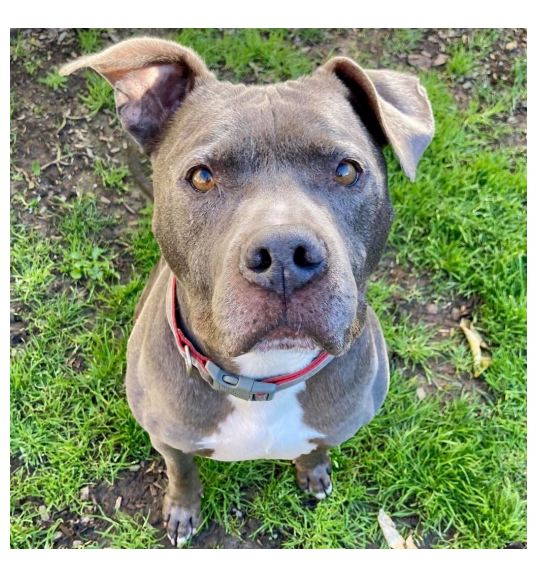
Bailey 2 years old

Kiss me, I'm Bailey - a sweet, petite pittie mix dressed to impress in my little tuxedo! I'm the kind of lass who wants to be the center of your attention and will reward you with tons of cuddles and whiskery smooches.