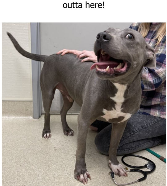
Rocky 7 years old

Are you looking for a lithe and lively leprechaun to keep you on your toes? I'm the resident go-getter! I'm young, athletic and I'm looking for an adopter who can give me the all the exercise and engagement I need in my life. I'm ready to Riverdance on