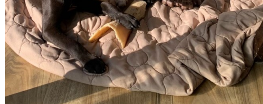
Parvo puppies that went to foster: Ponyo, Haku, Mei, Lettie, Totoro and Radish Spirit.

❤️ Ready to bring home your new fuzzy family member? Click here to see how!! ❤️