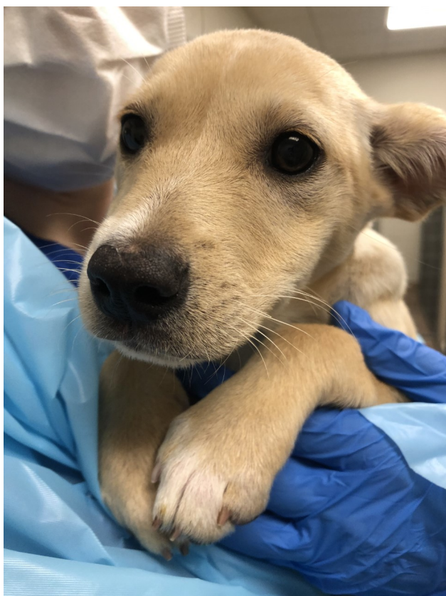
Mei the puppy getting her picture taken for her bio.