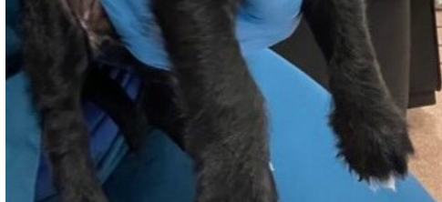
Sosuke, the smallest of the puppies.