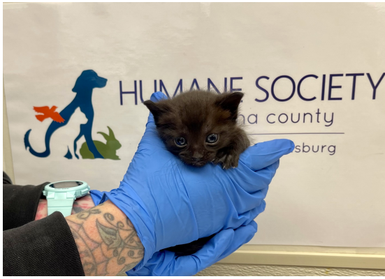
Tai having a check up!

Tai is one of the first kittens to arrive at HSSC this year! As we celebrate the unofficial start of Kitten Season 2022, we salute everyone who helps us save these vulnerable, precious, itty bitty beings: our hardworking rescue partners, our skilled and dedicated foster volunteers and YOU!