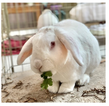
Join Team Turner!