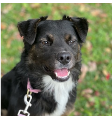
Join Team Summit!